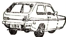
Reliant 'Robin' Saloon

Dozens of Mopeds, Motorcycles and Three Wheelers in stock, including Norton, Suzuki, Honda, Mobylette, Puch, Reliant Three and Four Wheel cars, Spares stockists for Reliant Regal and Rebel cars, Norton, Honda, Suzuki, Raleigh and Mobylette.